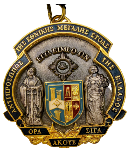
GRAND REPRESENTATIVE from NGLG near...