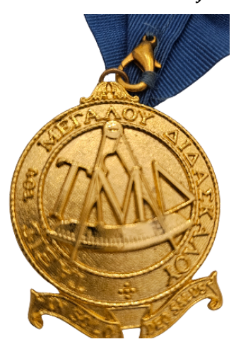
Grand Master's Order of Service to Masonry