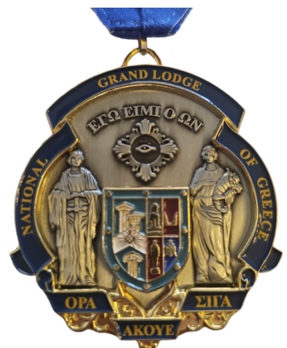
HONORARY MEMBER OF NGLG